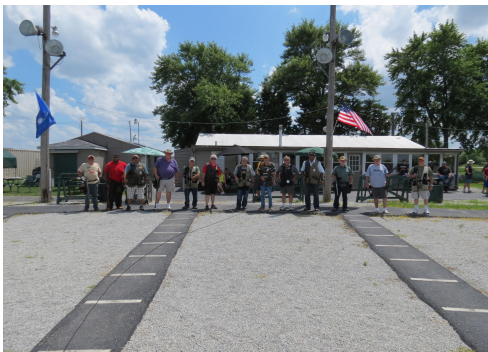
Serious fire power