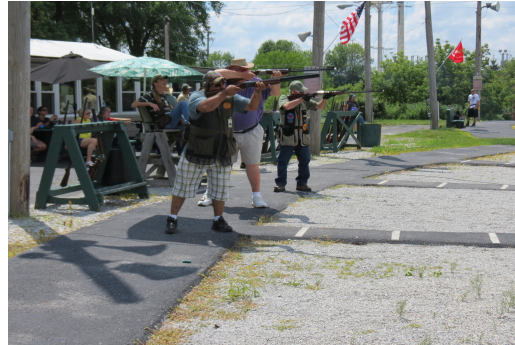
Winner, winner, chicken dinner!